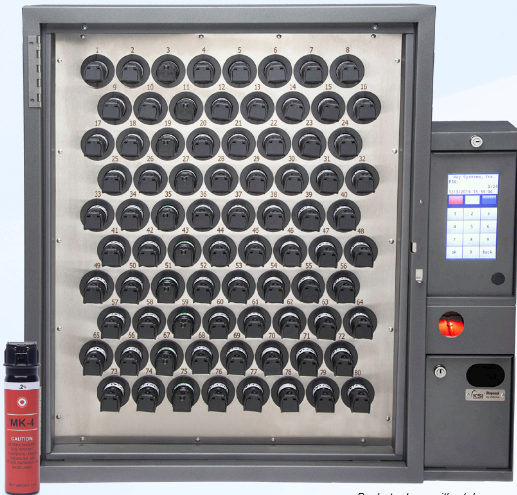
Products shown without door