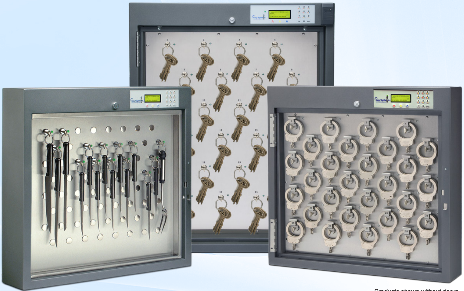
Products shown without doors