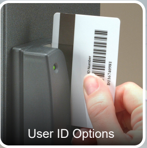
User ID Options

KSI's extensive product line and custom engineering solutions are tailored to produce a more secure, efficient, and cost-effective operational environment. Cities and municipalities across the country have turned to key control and asset management systems to enhance security, improve employee efficiency, and manage security-related expenditures.