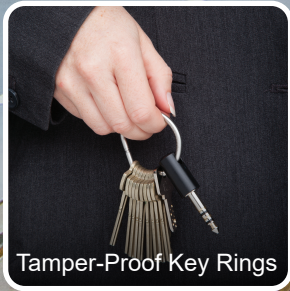
Tamper-Proof Key Rings