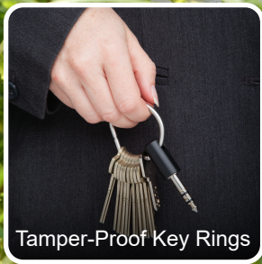
Tamper-Proof Key Rings