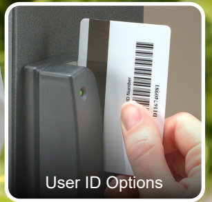
User ID Options

The cannabis industry is a prospering and competitive market with new opportunities and challenges emerging daily. Effective security measures are essential to prevent theft, unauthorized access, and diversion, ensuring the safety of both assets and personnel. Comprehensive security solutions enhance operational efficiency, safeguard sensitive data, and protect against potential external and internal threats. Key Systems, Inc. provides state-of-the-art security solutions designed to meet the unique needs of the cannabis industry. Our advanced locker systems ensure you maintain complete control over your inventory and operational assets.