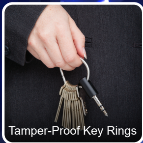
Tamper-Proof Key Rings